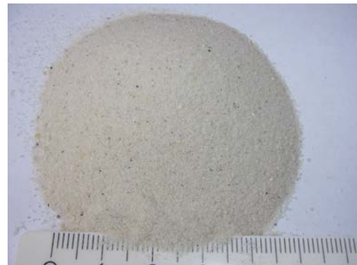
Fig. 1: 20 g sand as base material for a test milling

Due to this fact, silicon dioxide obtains its special hardness of 7 on the Mohs scale (compared to Diamonds = 10) and the extremely high melting point of 1713°C. These characteristics enable the utilization in the semiconductor or construction industry. [1][2]