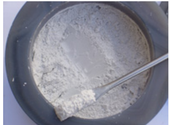
Fig. 3: 100 g quartz sand ground 5 min, P-6, 250 ml agate grinding bowl, 20 mm grinding balls

Due to the brittle character of sand is the comminution unproblematic. But it must be kept in mind, that because of its composition it may vary in its abrasiveness. In order to minimize this influence, typically a mill with impact forces is chosen. The FRITSCH Planetary Mills are especially suitable for fast and effective processing. The application laboratory, as well as the application consultants performed a series of interlaboratory comparisons in order to optimize the grinding even further in regards to instrument choice, sample amount, addition of liquids and many additional parameters. These internal interlaboratory comparisons proof that the FRITSCH Planetary Ball Mills by far exceed the FRITSCH Mortar Grinder in the preparation of sand in regards to effectiveness and grinding duration. This is especially due to the transmission of power and energy. Planetary Ball Mills are optimized in regards to maximum energy impact. A distinct feature offers the FRITSCH Planetary Ball Mill premium line : through a clearly increased rotational speed, wet grinding is possible in the particle size range down to a few nanometres.