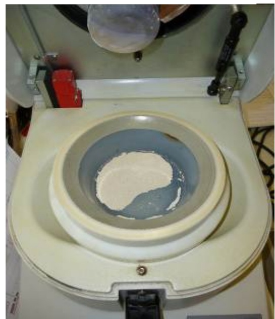
Fig. 2: 20 g Sand ground with the P-2 after 30 min, agate grinding set

The everywhere, naturally occurring commodity has always been used as construction material and for the production of glass. First supporting documents about glass come from Ugarit and are dated approximately 1600 BC. Via many developmental stages it became possible to produce glass cost-efficient and therefore suitable for everyday use. Glass in many variations is used day in and day out in almost every area. Still further characteristics were discovered which could be achieved by a physical or chemical treatment of the quartz sand. As early as 1899 already, conducted the chemist Robert Küch the first melting tests with pure silicon dioxide and was able to produce pure quartz glass. Chemically pure crystalline SiO 2 shows a heavy piezoelectric effect, which is utilized in the semiconductor technology and computer chip production. Generally established is the utilization as vibratory quartz in quartz clocks. But probably most important and surrounding us daily application is the use of silica sand in the production of concrete.